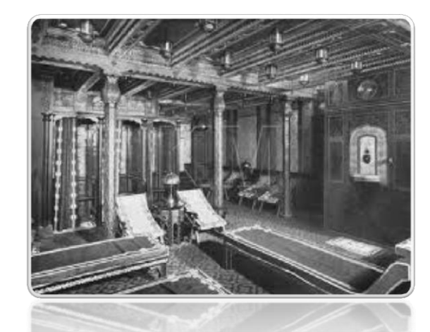
Shampooing Room, Steam Room, Cooling Room, Temperate Room, Hot Room... Soothe away the aches and pains in our unique Turkish Baths.

Please contact the reservations desk to schedule your spa experience today!